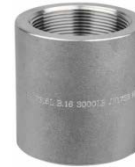
SW/Threaded Reducing Coupling

1/8"-DN6 1 1/4"-DN32 1/4"-DN8 1 1/2"-DN40 3/8"-DN10 2"-DN50 1/2"-DN15 2 1/2"-DN65 3/4"-DN20 3"-DN80 1"-DN25 4"DN100