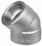
45° SW/Threaded Elbow

1/8"-DN6 1 1/4"-DN32 1/4"-DN8 1 1/2"-DN40 3/8"-DN10 2"-DN50 1/2"-DN15 2 1/2"-DN65 3/4"-DN20 3"-DN80 1"-DN25 4"DN100