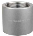
SW/Threaded Half Coupling

1/8"-DN6 1 1/4"-DN32 1/4"-DN8 1 1/2"-DN40 3/8"-DN10 2"-DN50 1/2"-DN15 2 1/2"-DN65 3/4"-DN20 3"-DN80 1"-DN25 4"DN100