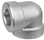
90° SW/Threaded Elbow

1/8"-DN6 1 1/4"-DN32 1/4"-DN8 1 1/2"-DN40 3/8"-DN10 2"-DN50 1/2"-DN15 2 1/2"-DN65 3/4"-DN20 3"-DN80 1"-DN25 4"DN100