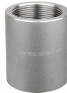
SW/Threaded Full Coupling

1/8"-DN6 1 1/4"-DN32 1/4"-DN8 1 1/2"-DN40 3/8"-DN10 2"-DN50 1/2"-DN15 2 1/2"-DN65 3/4"-DN20 3"-DN80 1"-DN25 4"DN100